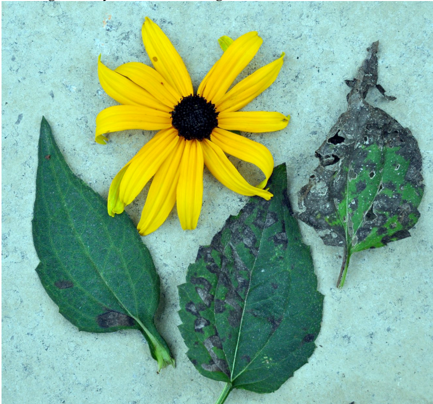
The fungal disease that's ruining the reign of 'Goldsturm' blackeye Susan begins as a spot, then spreads and kills the leaf, stem or crown of the plant.

Poor 'Goldsturm' became a victim not only through its own genetic weakness but because of how we handle the plant. Consider two things: One, that fungal problems like this become worse when infected plant parts are left in place over winter . In such a bed the number of fungal spores is so great that new spring growth has hardly a chance of escaping infection. Two, that many of us bought 'Goldsturm' in the first place for its winter interest -- to leave its good-looking, sturdy stems standing over winter